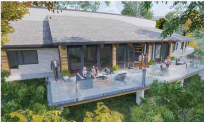
Renovation plans include enlarging the back deck for all to enjoy.